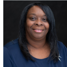
Commissioner Cheryl Harris Election District 4 Term expires in 2024