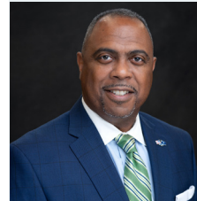
Commissioner Jamie L. Devine Election District 2 Term expires in 2024